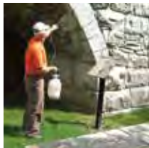
Handheld Pump-up Sprayer

Rapid, single step application, 1 or 2 wet on wet layers.