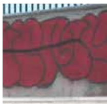
Red spray can bubble writing

TIP 2 If you are fixing someone else's former failure and may be having problems, then BBSM can be left overnight