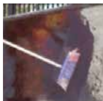
Broom on 3 coats of BBSM